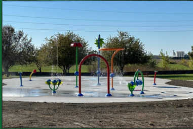
NEW JESUP SPLASH PAD