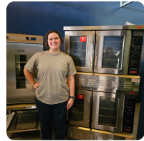
Gedney Bakery & Coffeehouse

Buchanan County was the recipient of two Catalyst grants in 2023! The purpose of the catalyst grant is to take a vacant or underutilized building and revitalize it both inside and out, and ultimately bringing in an appropriate business. BCEDC wrote the grants for the City of Fairbank and the City of Independence to apply for the $100,000 catalyst grant for a building in each of these communities. In Fairbank a third generation stepped up to save and refurbish the iconic Welsh Building which when completed will be the home of a trendy new restaurant bar and grill. In Independence, the new owners will be refurbishing the building to become the home to the new Gedney Bakery & Coffeehouse. In addition they will continue the trend in downtown Independence or revitalizing the upstairs and will be adding three high end upper story apartments. Once all are completed, this will bring the number of new upper story housing opportunities to 21 making downtown Independence a highly desirable location to live and visit.