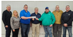
Nick's Family Grocery